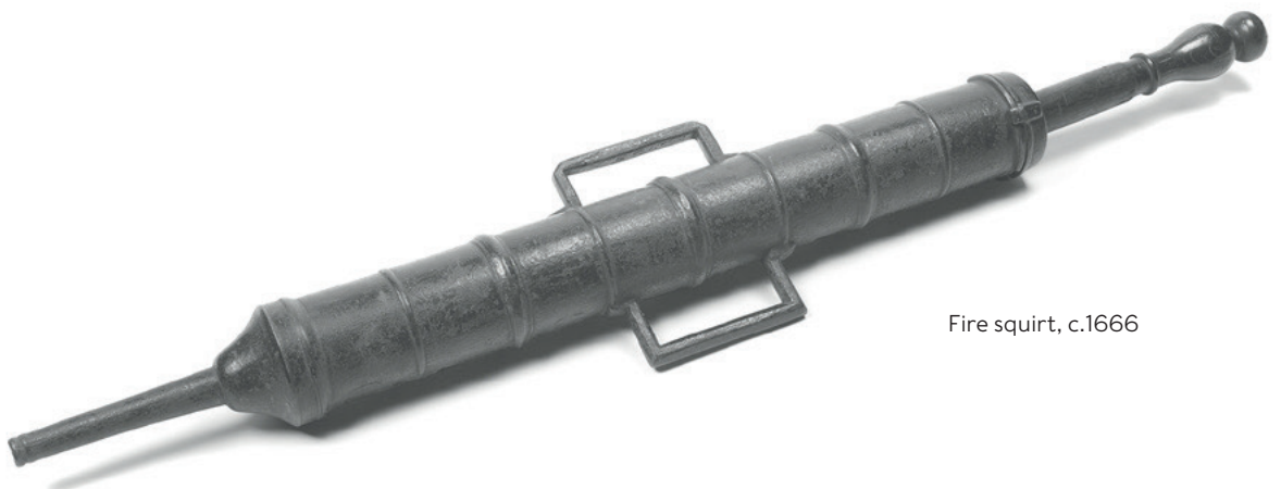
Fire squirt, c.1666

Hearth tax – a fee that people paid to the king. It was based on how many hearths (fireplaces) were in each house.