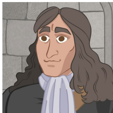
Sir William Penn (1621 – 1670)